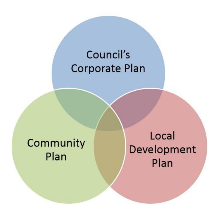
Figure 1: Important Linkages with other Council Plans and Strategies

1.12 The Local Development Plan provides a statutory link with the Council's Community Plan and will include a spatial land use reflection of the Community Plan, providing a vision of how places should change and what they will be like in the future.