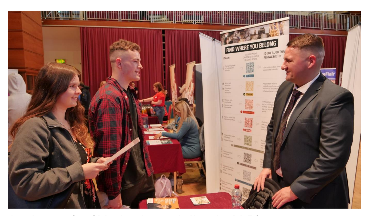
Attendees engaging with local employers at the November Job Fair