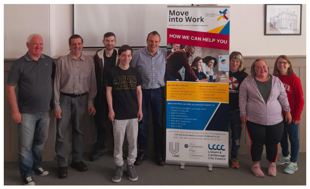
Move into Work Programme Participants