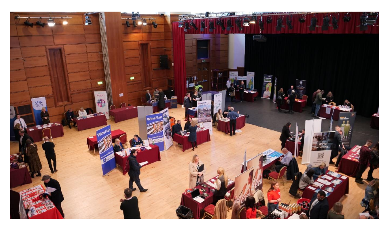
Job Fair, November 2022

206 people attended the November Job Fair in Lagan Valley Island. This event facilitated 20 employer exhibitors and 5 support organisations exhibitors resulting in recruitment opportunities for over 1,000 job vacancies.