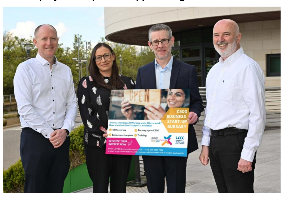
Launch of the Self Employment Options Support Programme

The overarching aim of this programme was to enable the Lisburn Castlereagh LMP to contribute to a reduction in Economic Inactivity. This programme focused upon