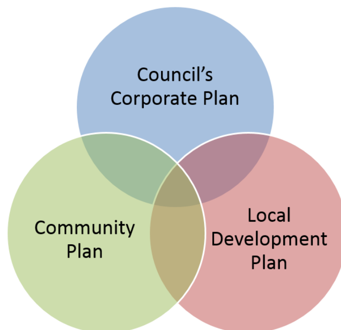
Figure 1: Important Linkages with other Council Plans and Strategies