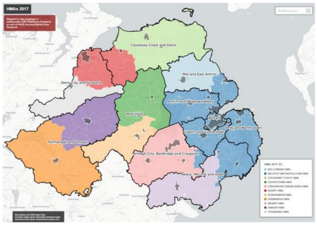
Fig 1 NI HMA Boundaries

LCCC falls within the Belfast Metropolitan HMA , the largest and most populous housing market. As can be seen from Fig. 1 and Fig. 2 below, the Belfast Metropolitan HMA covers our five neighbouring councils and also extends slightly into Mid & East Antrim Borough Council.