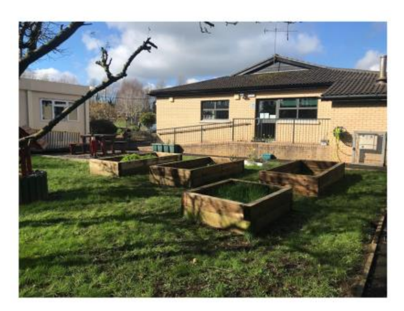
Funding for: Planters, decking planters, sensory plants and fruit bushes, accessible potting benches

Project Summary: On completion of our previous major project within the school grounds of installing 2 forest school sites, we recognised that one area adjacent to the Senior Forest School had similar potential to be rejuvenated. Clearing two sheds and a greenhouse from a wheelchair access pathway highlighted the potential to add raised growing beds along the forest school fence line where nothing currently grows. This would create an opportunity for the planting of a sensory wildlife corridor which would enhance the pupil's experience of transitioning to the forest school site.